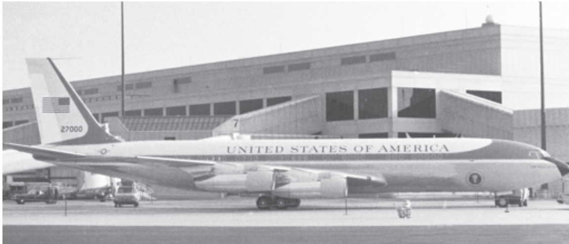
Fabco Power generators in use on Air Force I